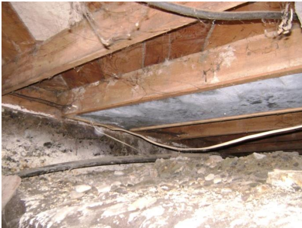
Home Crawlspace Before

Weatherization measures to be performed on each home are determined by a computerized auditing tool. This auditing tool determines what measures (i.e. insulation, duct sealing, furnace replacement) will be cost effective based on information gathered during the audit and your actual energy usages.