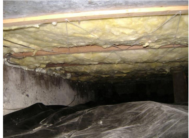
Home Crawlspace After